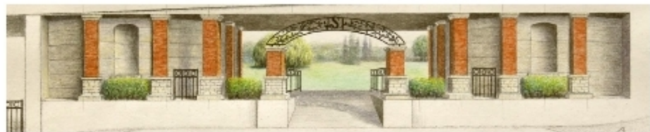
The Gateway by Bruno Capolongo

The City of Hamilton is currently conducting a public art competition to select a mural to be installed on the large concrete wall in Carter Park. A jury of volunteer citizens and artists has reviewed 33 artists' submissions and has short-listed the following 6 for public consultation.