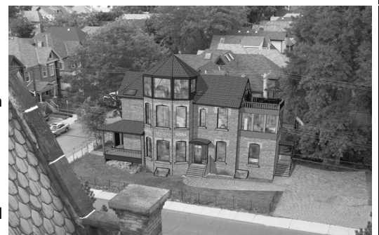
A rendering of what 109 Ontario St could look like